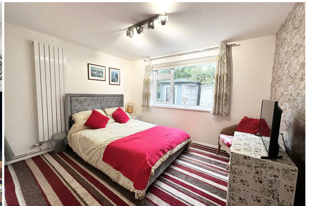
Horsedowns, Camborne, TR14 0NL